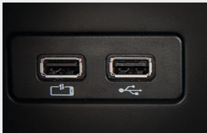
FRONT USB PORT.