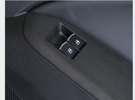
FRONT ELECTRIC WINDOWS.