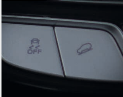
UP/DOWN HILL ASSIST.