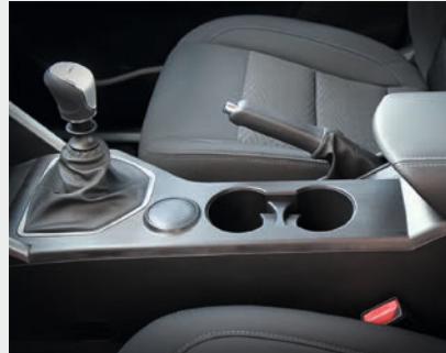
LUXURIOUS BLACK INTERIOR.