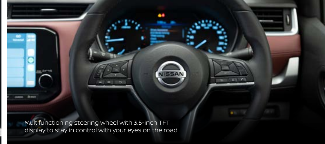
Multifunctioning steering wheel with 3.5-inch TFT display to stay in control with your eyes on the road

Embark on your daily adventures in unparalleled comfort. Expect a sleek driver cockpit and dashboard layout, with plush leather-appointed seats, and a leather stitched steering wheel and gear lever. Control all infotainment from the multifunction steering wheel and let NASA-inspired Zero Gravity front row seats assist in reducing fatigue on those longer journeys.