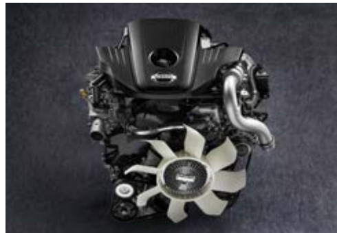
2.5ℓ DDTI INTERCOOLED TURBO DIESEL ENGINE

Whether it's rush hour traffic or pouring rain, count on the muscle, efficiency and safety you need to get you through it comfortably.