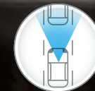
ELECTRONIC BRAKE FORCE DISTRIBUTION (EBD) WITH BRAKING ASSIST (BA)

Seven sensors monitor driver inputs and vehicle motion, gently aiding the vehicle's ability to stay on the driver's intended path. Vehicle Dynamic Control helps control and limit both understeer and oversteer, maintains optimum traction and even applies brake pressure to reduce wheel slip on loose road surfaces.