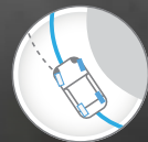
VEHICLE DYNAMIC CONTROL (VDC)

Seven sensors monitor driver inputs and vehicle motion, gently aiding the vehicle's ability to stay on the driver's intended path. Vehicle Dynamic Control helps control and limit both understeer and oversteer, maintains optimum traction and even applies brake pressure to reduce wheel slip on loose road surfaces.